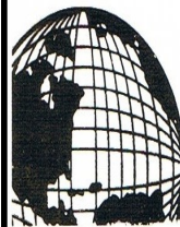
McAlpine Mill Site